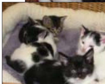
Mimi and her kittens

Mimi is the proud mother of 4 healthy little black-and-white kittens, and Trixie couldn't be happier about her 5 little tigers.