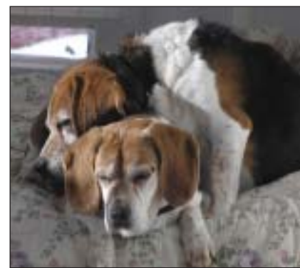
Scout and Freckles