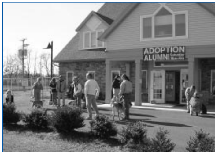
Adoption Alumni 2003

year, the Adoption Alumni is a rewarding experience by instilling in us a renewed sense of purpose. Most important, it is a testament to the ethic that by working together—staff, volunteers, adopters, and supporters—we can, in fact, help to create a more humane world for animals.