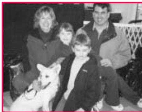
The Shiflett Family