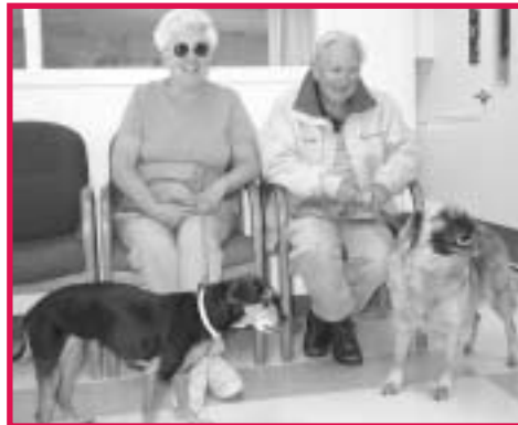
The Vreeland Family