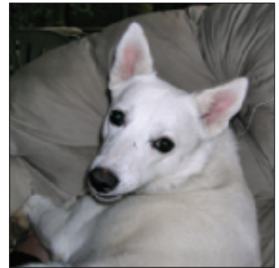
Snowflake Valiulis—just loving life.