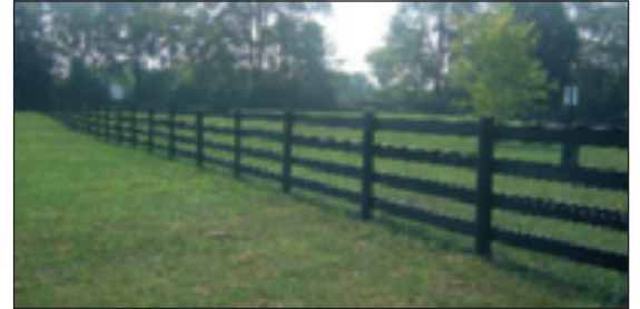
Completed 4-board perimeter fencing.

While installing the fencing, we also created an enclosed Dog Park that is now being used by our resident dogs and will also be available to visitors/presenters and their companion dogs during events like our Adoption Alumni, Tail Waggers' Wine Tasting, Cool to Care Camps, and other organizational events.