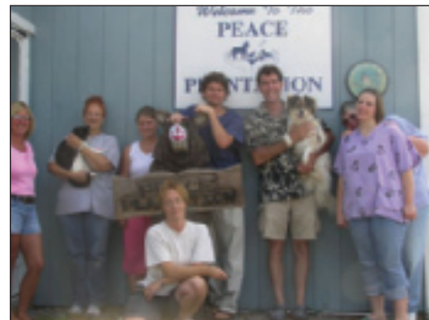
Some of Peace Plantation's Staff

his/her position is only one year. It does, in fact, take a unique person with a quirky spark to devote their careers to caring for animals. I just happen to work with some of the best!