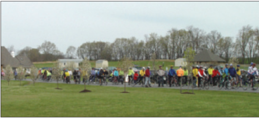
Pedal for Pooches' riders gathering at the start.