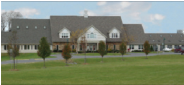
The Briggs Animal Adoption Center

Best greetings to each of you from the staff, volunteers, and animals of The Briggs Animal Adoption Center (BAAC). It's been a wonderfully busy time at the BAAC over the past months, beginning with our Sixth Annual Pedal for Pooches and including community support actions, such as the BAAC donation of a protective vest to the Jefferson County Sheriff's newest